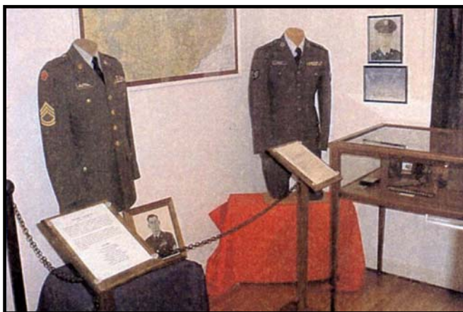
An exhibit in the Veterans Museum of the Mid-Ohio Valley in Parkersburg. WVAM held a workshop on Military Object Identification at the museum in November 2007.