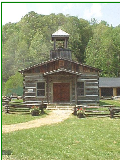
Village Church at the Heritage Farm Museum

The annual conference is scheduled for March 27 – 29, 2008, in Huntington, West Virginia and will offer a large variety of experiences through visits to the many museums located in that area. Among the various choice sites, WVAM members will visit Heritage Farm Museum, the Museum of Radio and Technology, Huntington Museum of Art, Madie Carroll House plus many more.