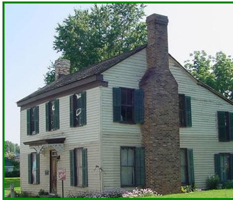
Madie Carroll House