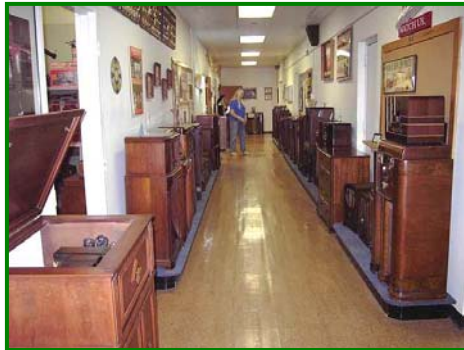
Inside the Museum of Radio and Technology

Thursday, March 27 - Saturday, March 29, 2008